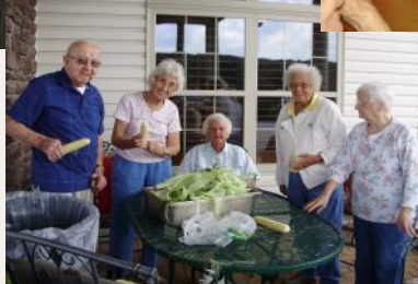
Husking corn for dinner